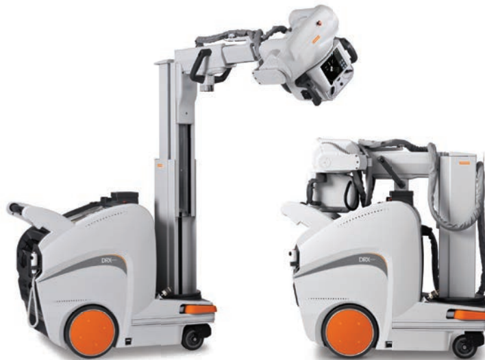
The DRX-Revolution's collapsible column makes it easy to navigate.

For accelerated productivity and elevated patient care, join the revolution. The DRX-Revolution.